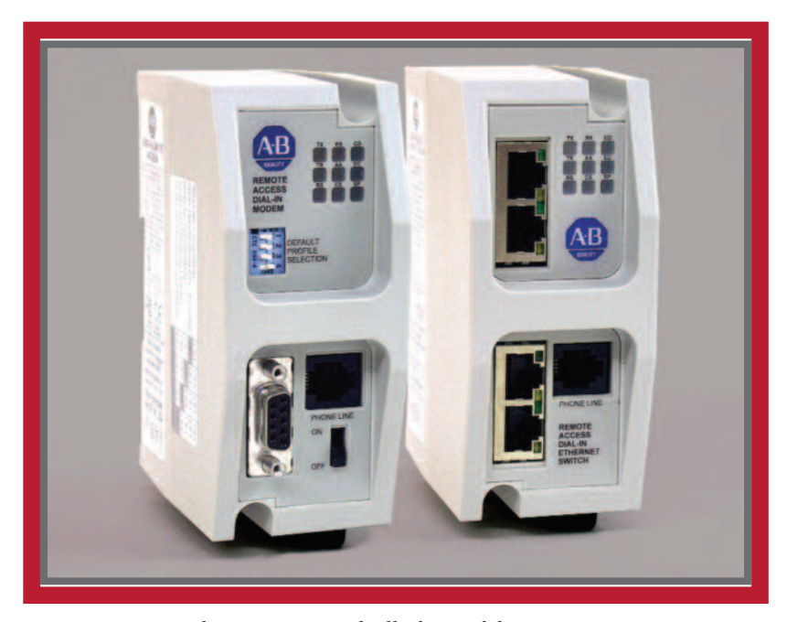
Remote Access Modem Kits are specifically designed for remote connection to control systems and include everything you need to easily connect the first time, and every time.